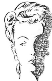
MARION-EL 724 1/2 PICKENS ST.

The honor guests for the afternoon will be the